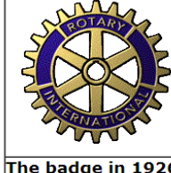
The badge in 1926